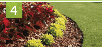
4 Crisp Edges