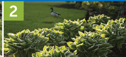
2 Weed Free