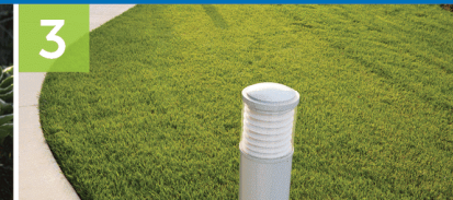
3 Green Turf