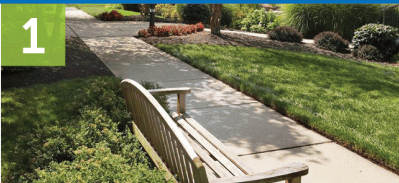
1 Site Cleanliness