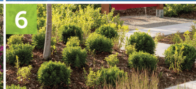
6 Uniformly Mulched Beds